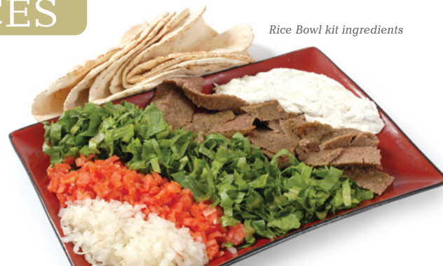
Rice Bowl kit ingredients